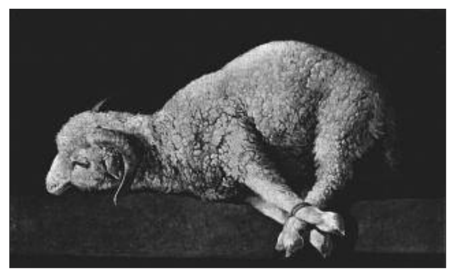
Agnus dei (c1635): Francisco de Zurbaran

'The Salvation Army is called to embody God's immense salvation in a wounded world.' The challenge to each generation of Salvationists is to interpret the message of the Atonement in terms that can be understood, and to live authentically and attractively, embodying the message that they are called to share.